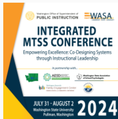
MTSS Fest 2024 Pullman July 31-August 2