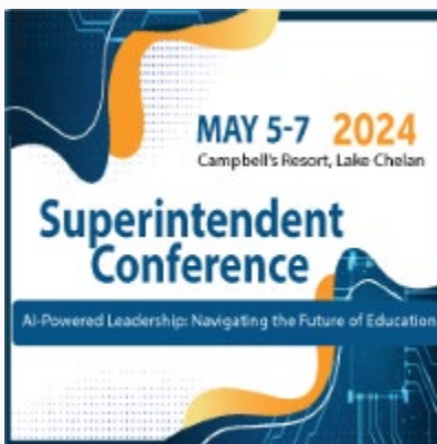
Superintendents Conference Lake Chelan May 5-7