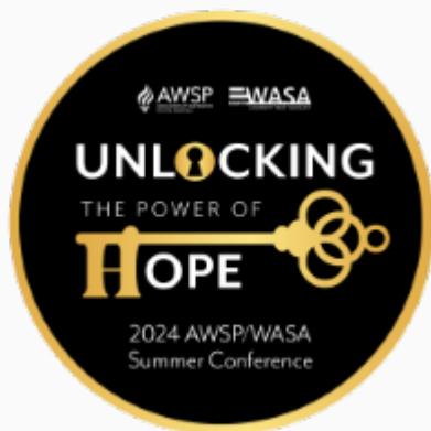
AWSP/WASA Summer Conference Spokane June 23-25, 2024