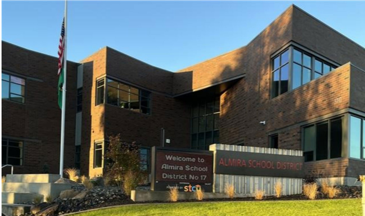
Almira School District