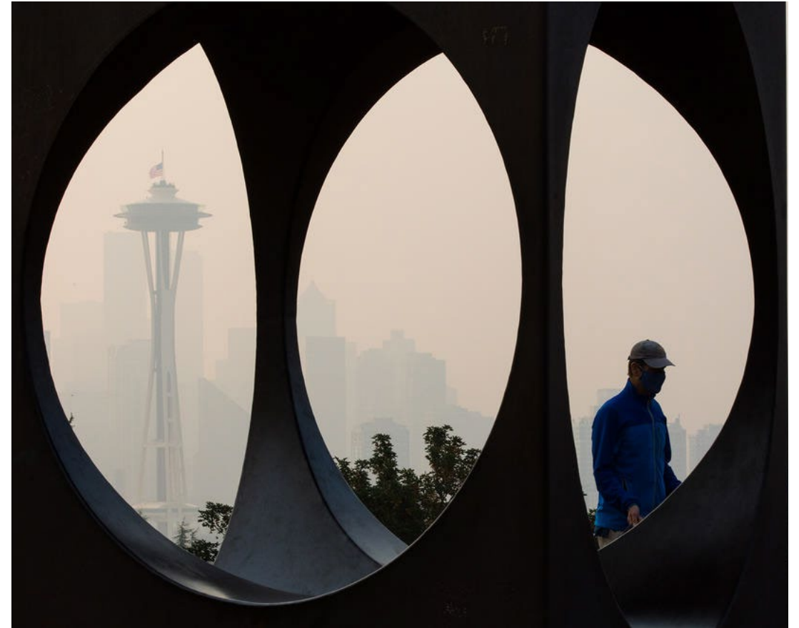
DeLong, D. (2020). Wildfire smoke obscures the Space Needle and the Seattle skyline in a view from Kerry Park . Investigate West . Retrieved September 25, 2023, from https://www.invw.org/ .