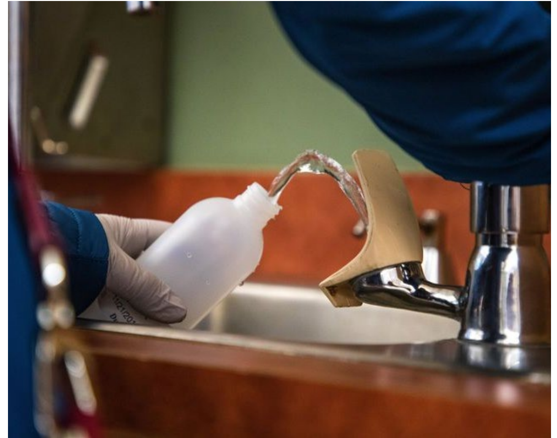
Siegal, M. (2019). A Seattle Public Schools administrator collects water for testing from a drinking fountain at Emerson Elementary School in South Seattle. The Seattle Times . Retrieved September 20, 2023, from https://www.seattletimes.com/ .