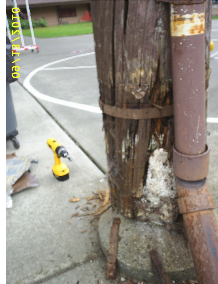
Monroe – Emergency Repair Pool – Beam Replacement.