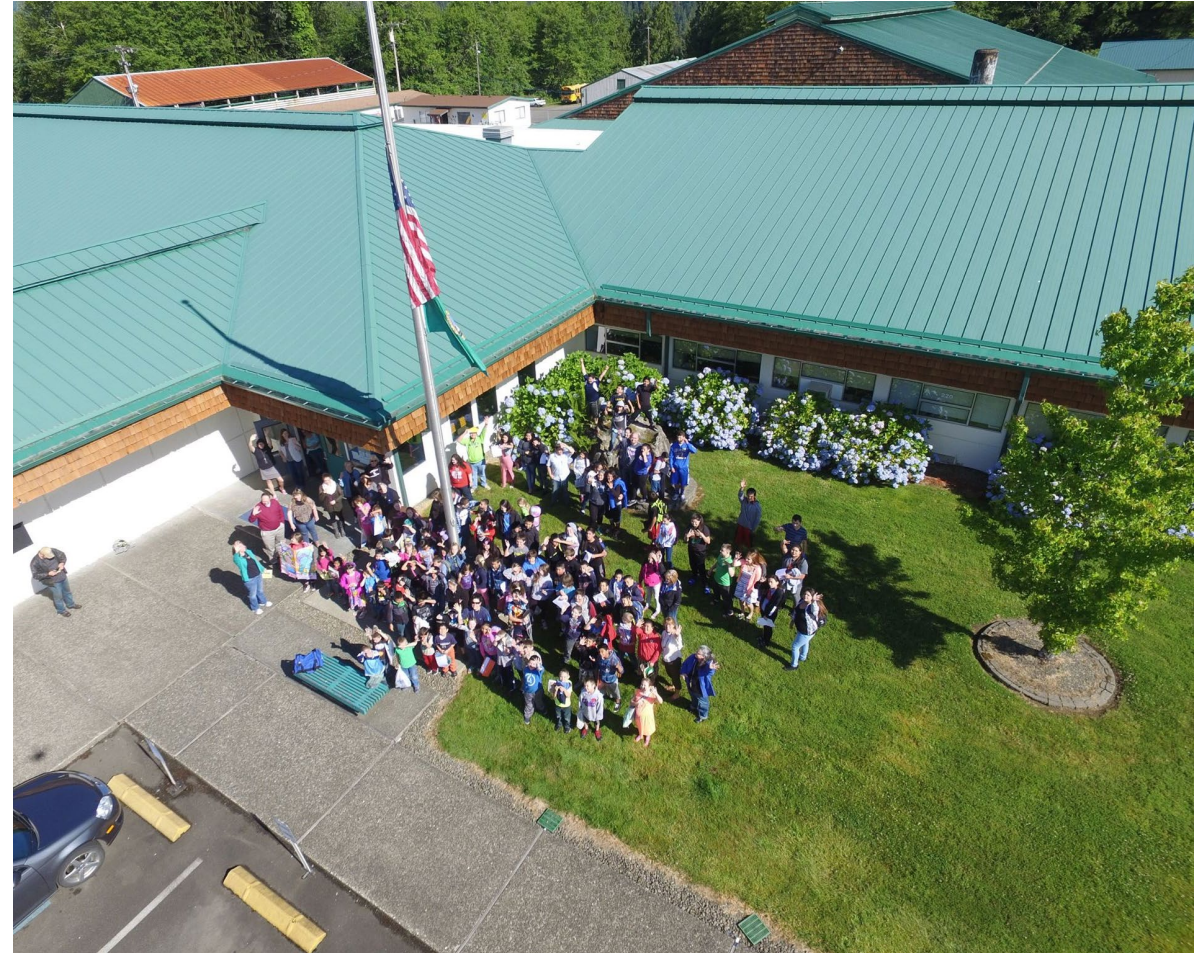
Lake Quinault K-12 School, Amanda Park.