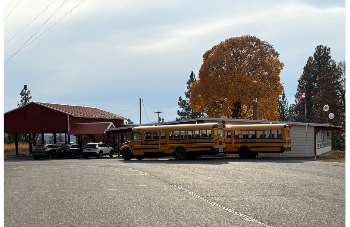
Evergreen K-6 School (serves ~40 students)