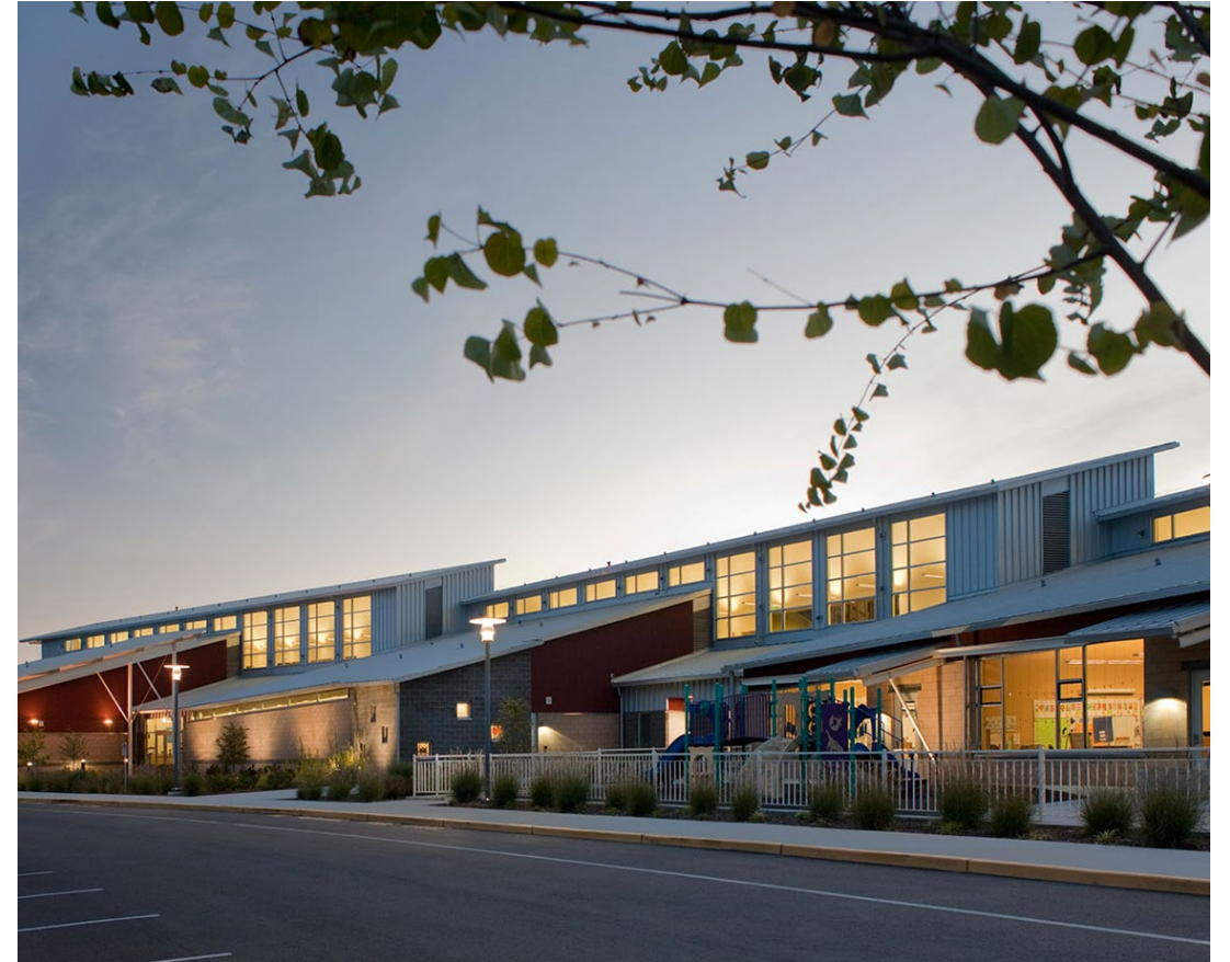
Midway Elementary School (Des Moines) was built in accordance with Washington Sustainable School Protocol (WSSP), which was created by Washington State to emulate LEED standards and energy-saving strategies for public school buildings.