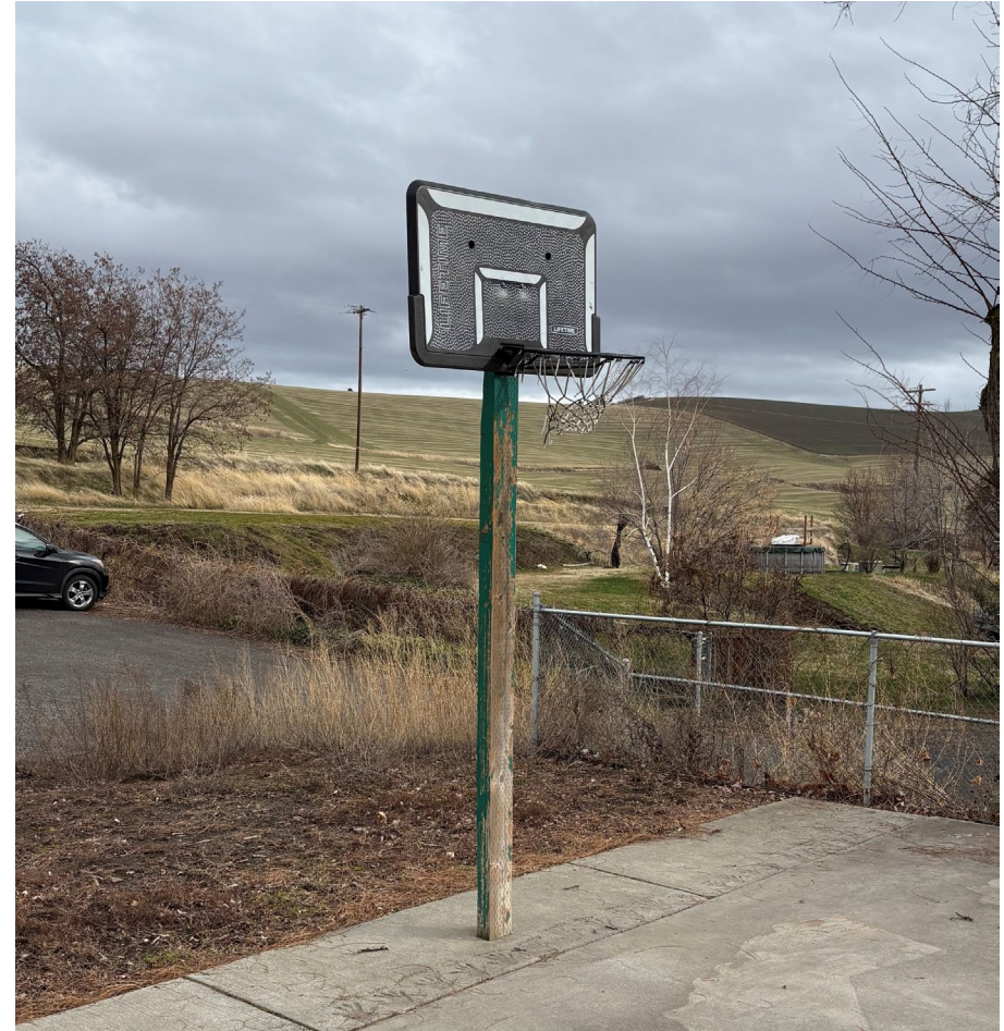
A basketball hoop at Dixie Elementary (serving 14 students)