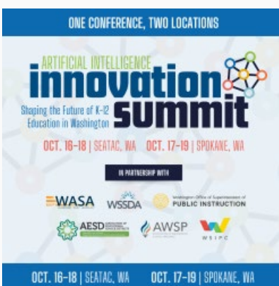
AI Summit East Spokane October 17-19