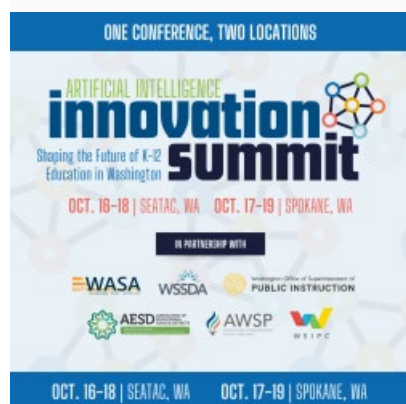
AI Summit West Seatac October 16-18