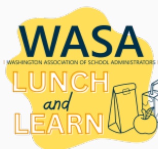
Lunch and Learn Part 1: Legislative Platform Review Virtual September 25 | 12:00-1:00 p.m.