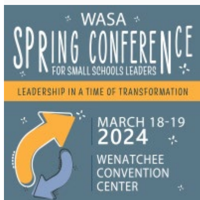
WASA Spring Conference for Small School Leaders Wenatchee March 18–19 REGISTRATION OPENS JANUARY 9TH!