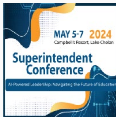
Superintendents Conference Lake Chelan May 5–7