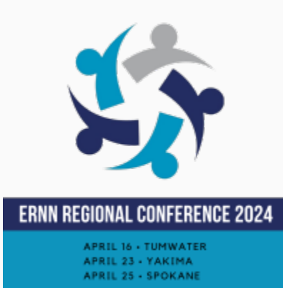
ERNN Regional Conference April 16 in Tumwater, April 23 in Yakima, April 25 in Spokane 8:30–2:30 p.m. SAVE THE DATE!