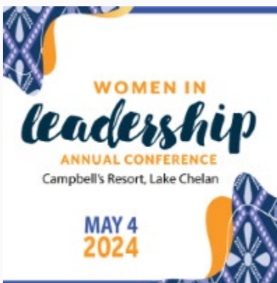
Women In Leadership Conference Lake Chelan May 4