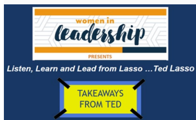
WIL: Listen, Learn, and Lead from Ted Lasso Virtual | COMPLIMENTARY! March 13 | 12–1 p.m.